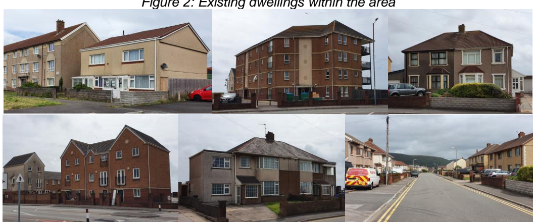
Figure 2: Existing dwellings within the area

The site is considered to be in a sustainable location, well served by public transport with a cycle route and the wales coastal path running along the entire seafront. The site is also located with easy walking distance of shops, restaurants, a cinema, swimming pool, football ground, play facilities and parks and gardens. The area comprises a mix of terraced and semi-detached houses and block of flats up to 4 storeys in height which are finished in a range of materials, including brick, stone, concrete cladding, render and spa dash (see figure 2).