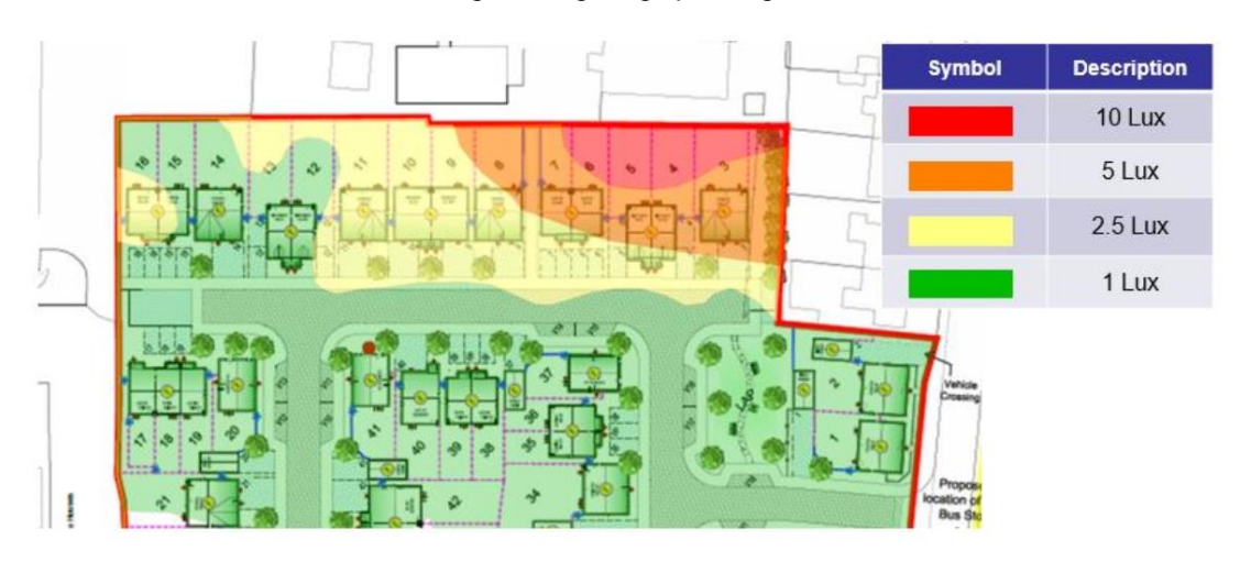
Figure 8 lighting spill diagram

The extract from the lighting survey below shows the area affected in red.