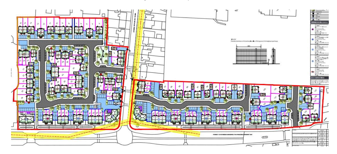
Figure 3: Site Layout

The houses and apartments will vary in height and design and will be finished in a combination of brick and high quality coloured cladding that will vary along the frontage to provide visual interest. The layout is shown on the site plan below (figure 3):